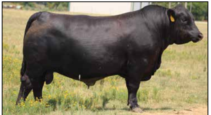
LAWMAN TRADITION 918E5

Curve bender ET bull out of Tradition and one of the top donors at Lawman Ranch, Vorel MS Onstar 918B. Calving ease, tons of growth, moderate in size, carcass improver, and very docile.