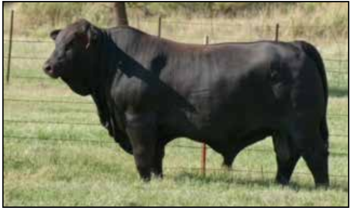
WAITS RIGHT FOCUS 916E2

R10343718 • 173E • P • GEN: 2 • 3/6/17 • AI • Waits