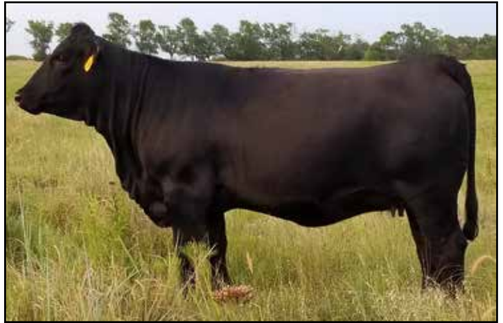
PV MISS TEXAS STAR 918D

MC ROCK STAR 924U6 TEXAS STAR R10191789 MS CSONKA 9U8U3 COOLEY MENARD 326S SCC MISS MENARD 918X29 UB10187347 SUHN'S MS CONFEDERATE 918S MC JETHRO 00S3 MISS NMSU 924 CSONKA OF BRINKS 30R4 MISS 4L BEST BET 9U8P5 CONNEALY FREIGHTLINER KDB ELLUNA M120 CONFEDERATE SUHN'S MS JOHN WAYNE 918P2