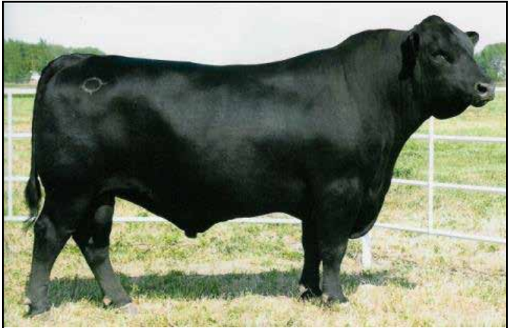
SIRE OF LOT 17: MYTTY IN FOCUS

R10331554 • 211D • P • GEN: 1 • 8/23/16 • AI • Waits