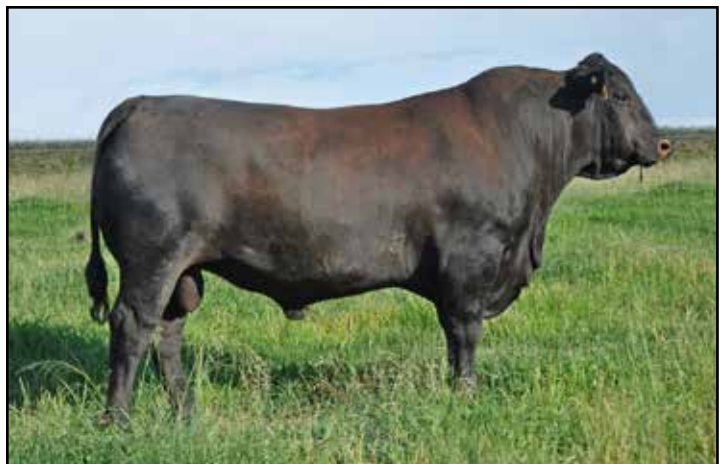
SIRE OF LOT 26: VOREL OPTION 918Z3

One of four full et brothers out of the Vorel MS Landau 361A15 and the Vorel Option 918Z3 herd sire. These bulls are UB2 and mated to a registered cow. You will get 1st generation Brangus calves.