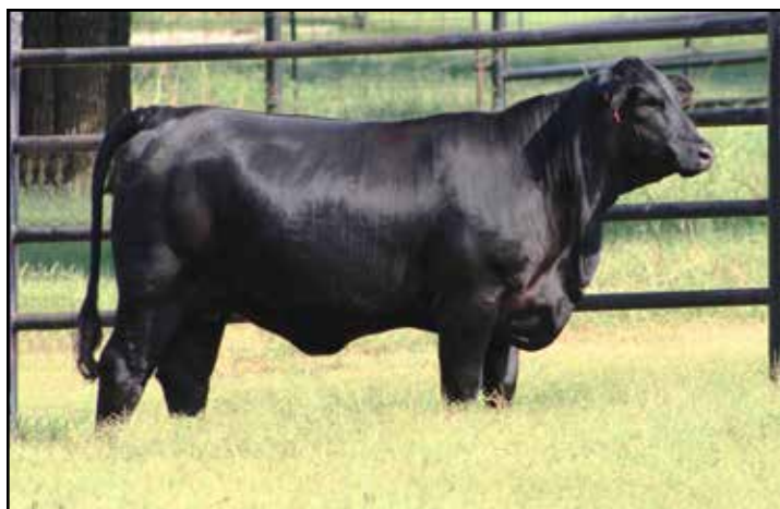
JG MISS 1010E1 BRINKS JET

When looking for a female that combines eye appeal, genetics and EPDs all into one package check this lady out. AI'd 8/6/2018 to RCCTitlelist 88A. (Show bull of the year 2015).