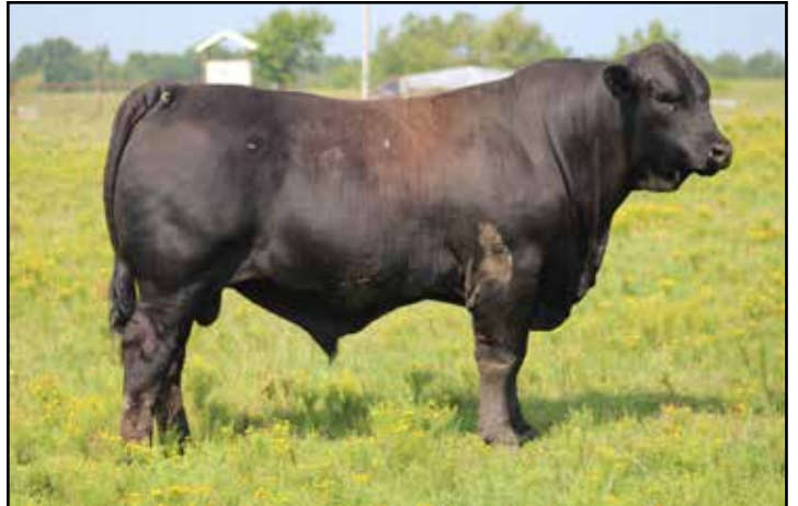
LAWMAN FOUNDATION 610E

Super clean and attractive Foundation son that has growth, maternal, and moderate calving ease. Foundation sons have been in high demand in recent years.