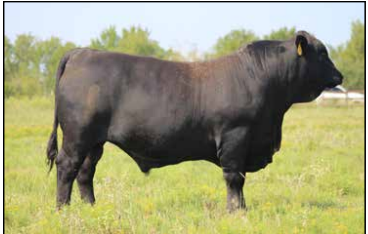
LAWMAN OPTION 361E11

Curve bender type bull that is a complete package UB2. Growth, carcass and mtelnal that will be a female maker.