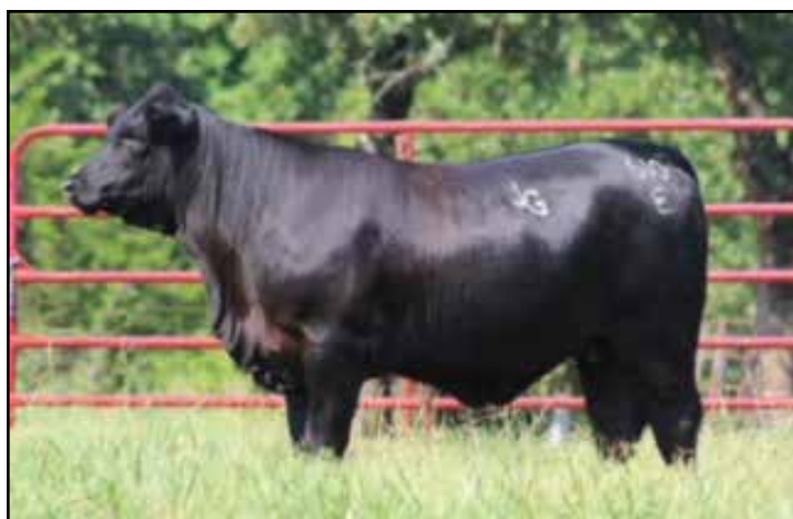
JG MISS 610E GARRETT JET

Study the rib shape, depth of body and feminine front end this female exhibits while standing on lots of bone for a great foundation. AI'd 8/6/2018 to Chili Pepper of Sankeys 6N Ranch.