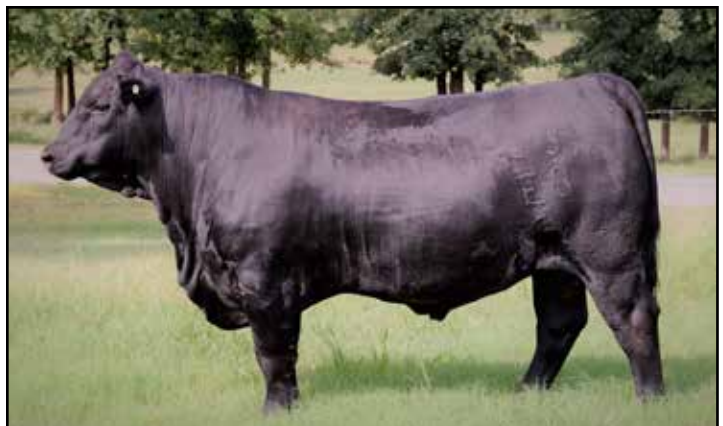
VOREL TEMPLATE 331E8

Calving ease, fertility, phenotype plus 9 traits in the top 30% or better. Donor grandam is 13 years old. Still raises a big calf. She's put numerous daughters and grand daughters in our herd. Hess a neat prospect. Look him up.