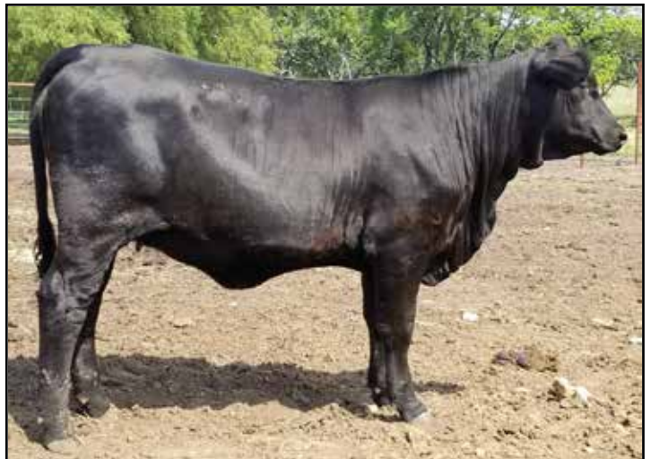
MISS PV FINAL CUT 655E3

Power, growth and maternal. Elite genetics with 607L11 and Final Cut, who is now deceased and semen is in very limited supply.