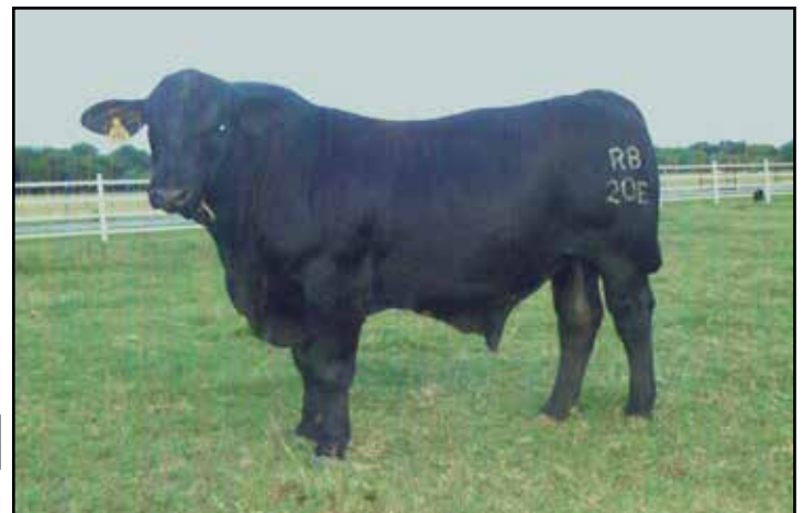
RB BODIE 20E

Another good Bodacious son. A well muscled, thick, sound bull. Ready to go to work. Again with huge scrotal and excellent EPD's. I believe you will really like his daughters.