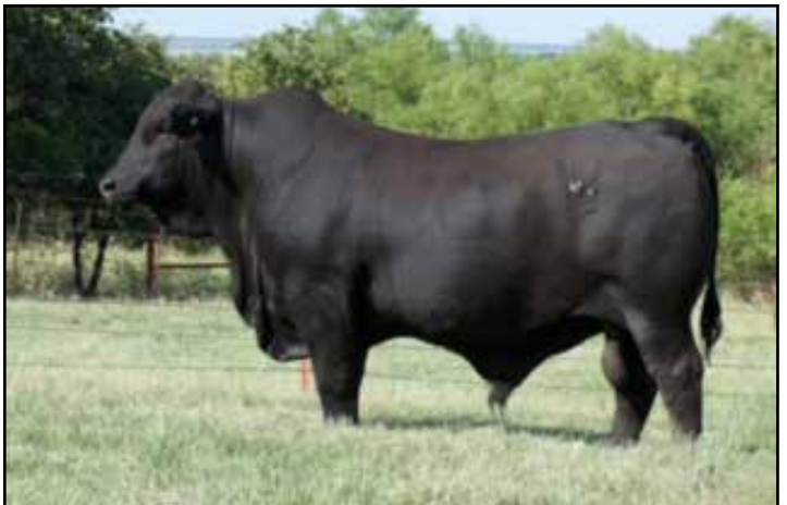
WAITS FOCUS 825E

R10347435 • 189E • P • GEN: 1 • 2/18/17 • AI • Waits