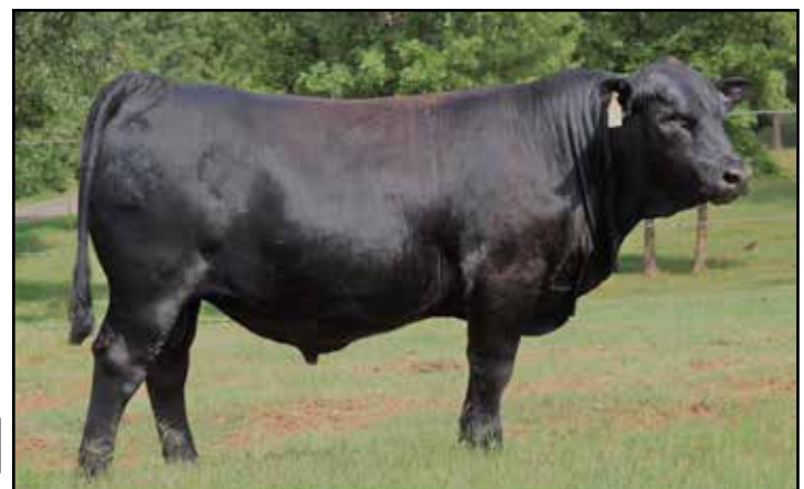
VOREL ONESOURCE 331E15