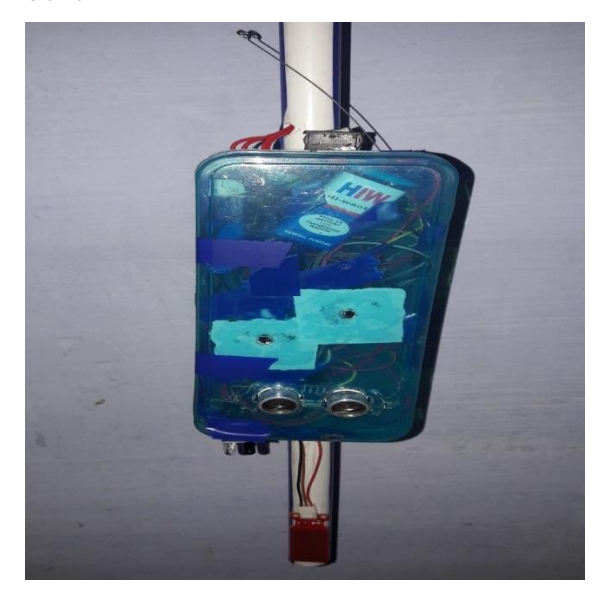
Figure 3. The modelled stick

The stick after being implemented with all sensors in the look like this-