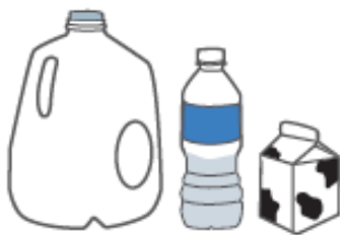
Bottles, Jugs, & Cartons