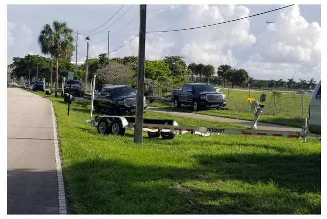
June 27th: 31 vehicles with trailers parked at Riverland Woods

A major boating publication reported that new boat sales were up by over 35% last year. A trip over to the Riverland Woods Boat Ramp on any weekend certainly confirms this statistic.