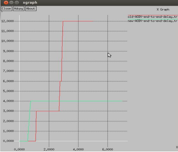
Fig.2: End-to-end delay

As shown in figure 1, the throughput graph is plotted in which the old throughput in which link failure scenario is analyzed. The new throughput is shown with green line in which link failure problem is resolved. The graphs shows that throughput of new scenario is better than existing scenario.