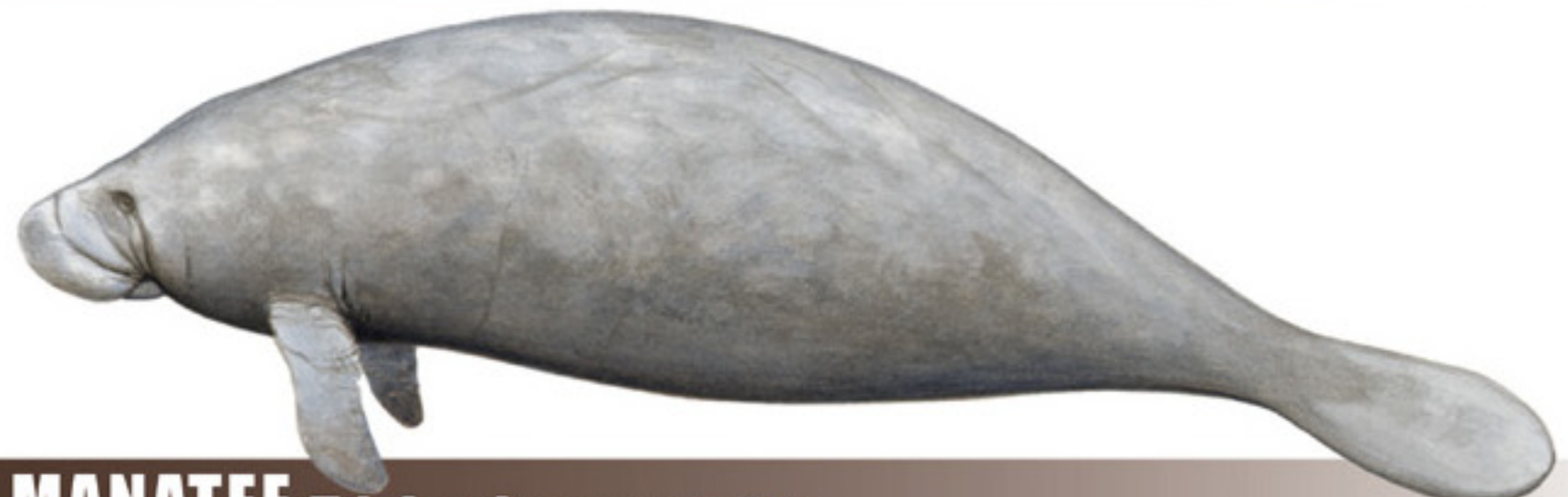
WEST INDIAN MANATEE Trichechus manatus