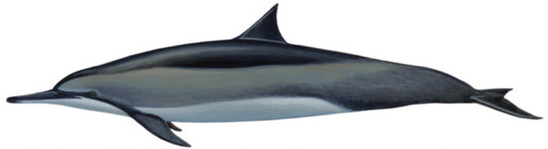
LONG-SNOUDED SPINNER DOLPHIN Stenella longirostris