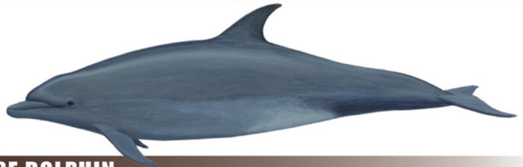
BOTTLENOSE DOLPHIN Tursiops truncatus