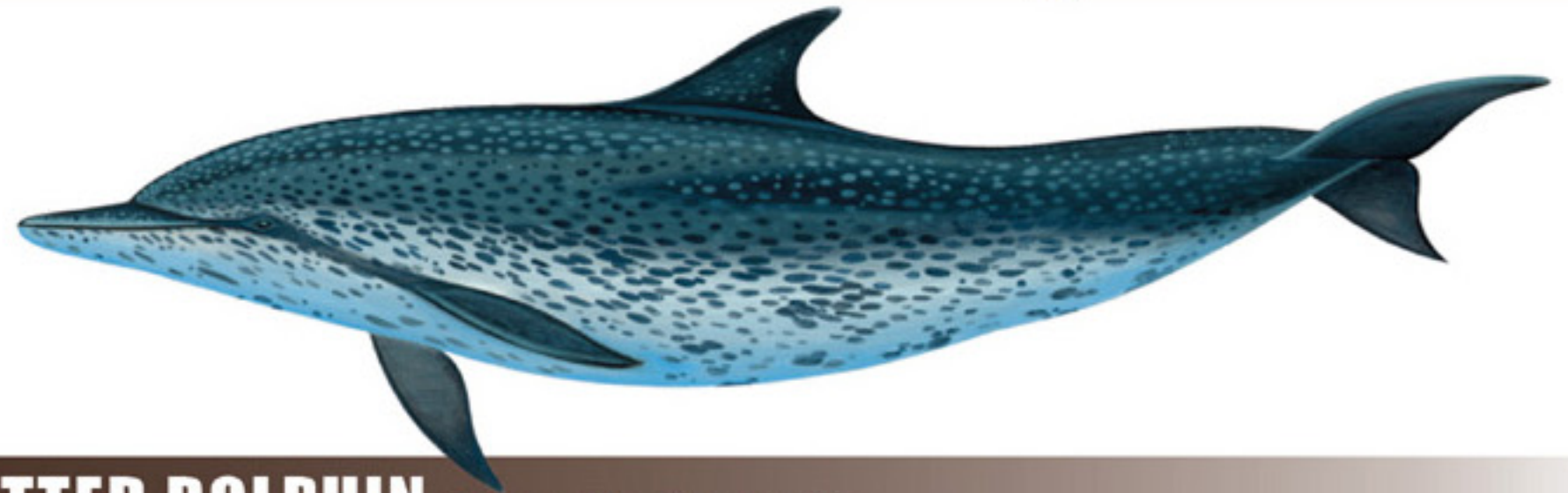
ATLANTIC SPOTTED DOLPHIN Stenella frontalis