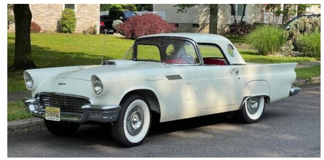
Tom Brieva's white 57 (See page 7)