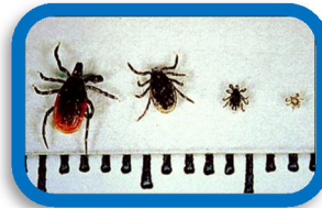
MN Department of Health www.health.state.mn.us/divs/idepc/dtopics/tick_borne/ticks

Lyme disease is transmitted via bites of infected nymphal and adult female blacklegged ticks (adult males do not feed). Nymphal bites appear to cause more disease than adult bites. Female and male adults, nymphal and larval ticks are shown here. While all are small, the size differential between the adult female and nymph is striking.