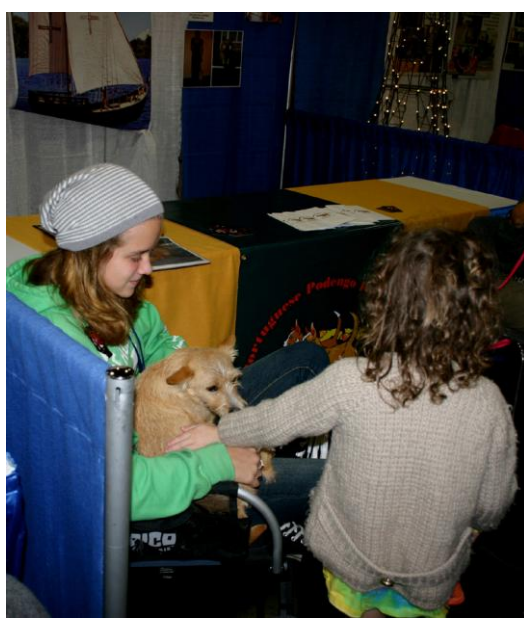
Children teaching children about Pequenos

The PPPs were exhausted by afternoon each day despite them being given "rest time" in their crates, but they carried on "meeting and greeting" and enjoying the kids as well as the adults. By Sunday afternoon, the Pequenos were sleeping in our laps for periods of time.....but so were many of the other dogs in the other breed booths. They had done their jobs well and we were proud of them !!!