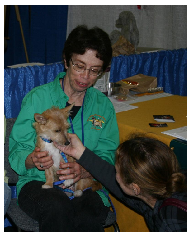
A puppy being approached correctly