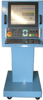
OSAI Open with Integrated PC

Axes Strokes X 3,850 mm (151") Y 1,850 mm (72.8") Z 400 mm (15.7") C +/- 360 Degrees Continuous