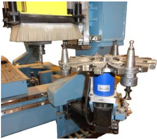
Traveling Automatic Tool Changer Magazine with 8 to 16 Tools