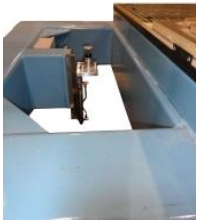
Optional Integrated Tool Touch Off