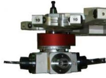
4 Exit 87 Degree Aggregate