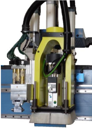
Equipped with a 13 HP Spindle and 7 Vertical and Four Horizontal Independent Drill Unit