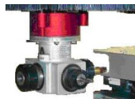
4 Exit Horizontal Aggregate