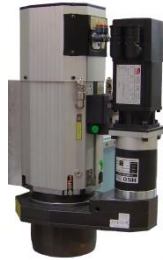
C Axis on Spindle Motor Allows for Rotational Axis Control of Aggregates