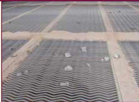
FLEX-MAT 3 Tensioned