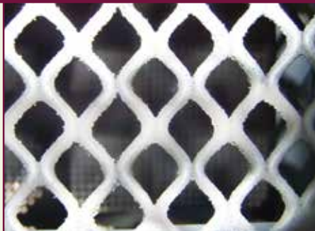
FLEX-MAT 3 Modular