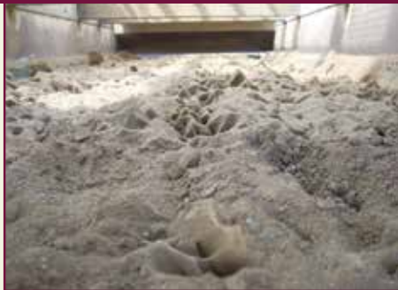
Woven Wire Square Opening