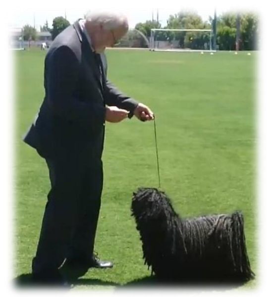
GCHB CH Cordmaker Boys Will Be Boys PT NAP NJP BIS, 2<sup>nd</sup> Virtual Challenge

Recently the AKC held its second AKC Virtual Top Dog Challenge which drew 400 entries.