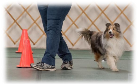
From PVSSC Rally Trial, February 2016

These pilot programs will end at midnight December 31 , 2020 and all video submissions must be received by that date and time.