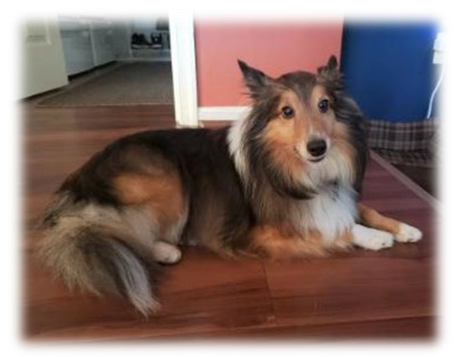
Dusty turned 8 years old on July 8. Happy belated birthday!