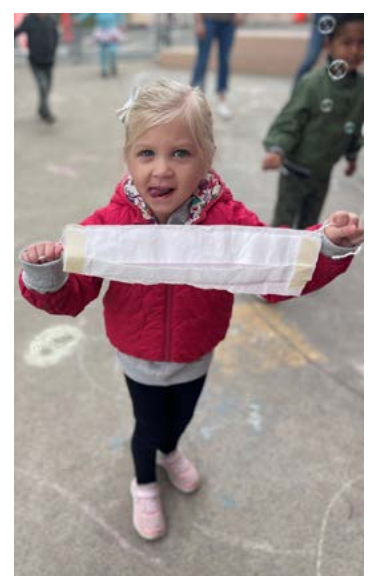
Below: Germs everywhere - the preschool children "catch germs" with their Goliath face masks.