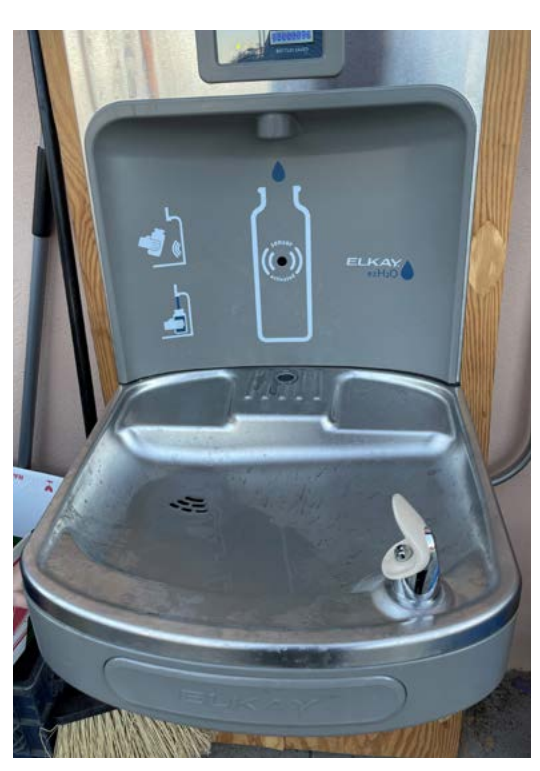
Above: Our water filling station