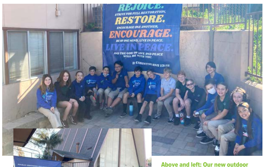
Above and left: Our new outdoor seating area

Another campus improvement is our new water filling station! As with many things over this COVID season, we have learned to do school in new ways. We needed to change how we served our lunches and take turns going to the bathroom. One of the things we noticed was that the kids had to come up to the cafeteria to refill their water bottles. The cafeteria is on the other side of the school from where the students have P.E. So the 2020/2021 Student Council decided to raise money to purchase a water filling station. At the station, just stick your water bottle up to the sensor. It fills quickly with cold, fresh water. A special thank you to Mr. Steven for installing this unit and to the student council members who helped come up with this idea. We look forward to many years of use.