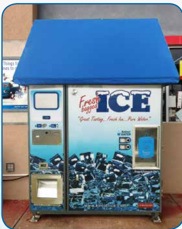
IM600XL Machine with Water Vending Station.