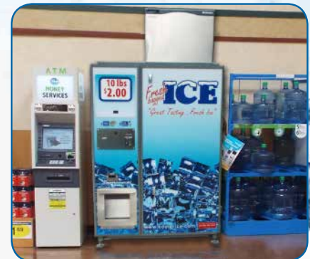
The IM600 in an Inside Application

Credit Card Only – For businesses that do not want their employees to have access to or responsibility for monies in the machine, the Credit Card Only option limits the form of payment for the ice to Credit Cards, similar to the Red Box® video kiosks.