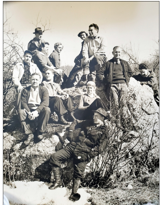
Camp Siwanoy / AT Hike, March 1941

Notes: Camp Siwanoy, located on Duell Hollow Road in Wingdale, was popular with scouts from the Westchester-Putnam region when it was in operation from 1926 to the late 1990s. Now a private house with a gated driveway, we can still begin and end this hike near the original meeting spot on Duell Hollow Road. But the country roads that the leader would have taken to connect to and return from the A.T. have been paved over, and a bridge closure in the direction of the Ten Mile River Valley view has resulted in a one-mile roadwalk on the current A.T. So instead of heading towards the Ten Mile River Valley view, we'll take the A.T. in the opposite direction and enjoy an equally beautiful view of the Harlem River Valley.