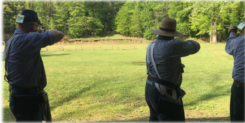
The 3 rd Georgia (with a 4 th LA pickup) busy taking second place in the Carbine match.

The first team event of the weekend was the Carbine match. Five teams came to the line with their cavalry long arms, and when the smoke cleared Forrest's Escort took first place, followed by the 3 rd Georgia, with the 44 th Georgia taking third place.