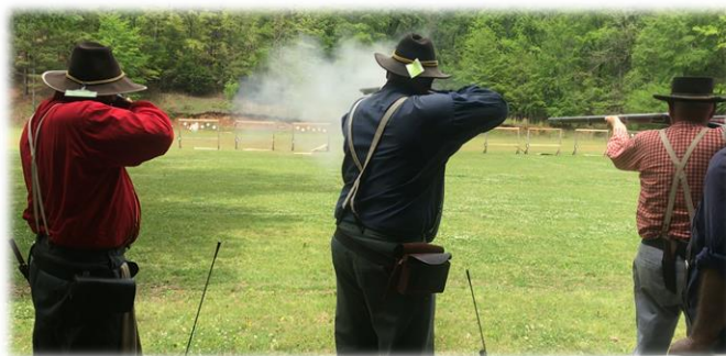
Forrest's Escort A team turning tiles into dust!