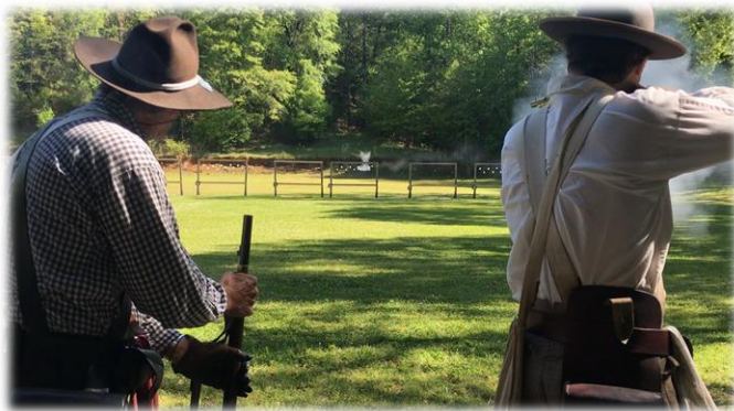
Musket teams on a perfect spring morning!