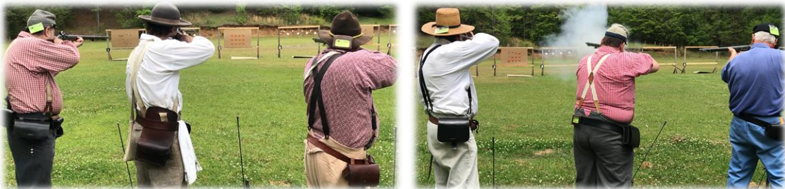
Forrest's Escort B team (left) and the 44 th GA (right) drawing down on some clay pigeons!

With the conclusion of the Carbine match came the Smoothbore match. Five teams slung round balls downrange, including one B team. Forrest's Escort took first place, the 44 th Georgia took 2 nd , and the 3 rd Georgia took third place.