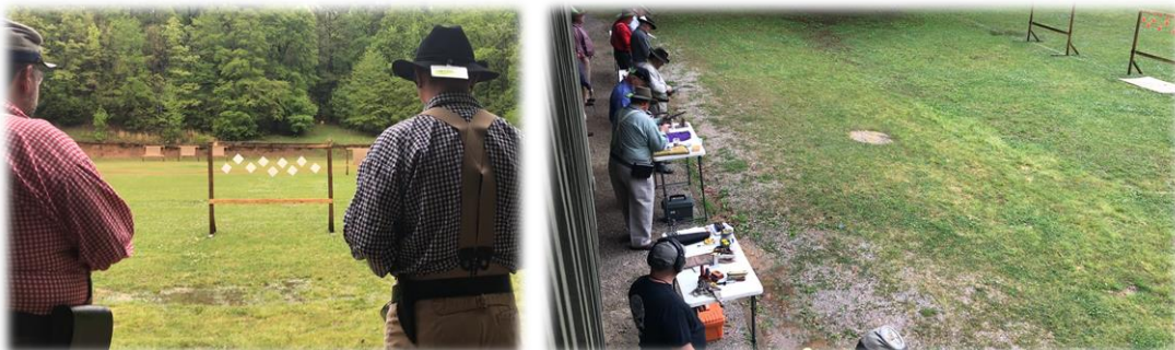
Everything looks bigger when the revolver match is at 15 yards!

By Saturday morning the rain had mostly tapered off, at least long enough for the Can't Miss 'Em revolver match to get squared away.