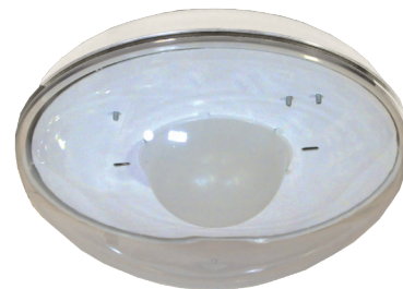
LED Diffuser for all Base Types