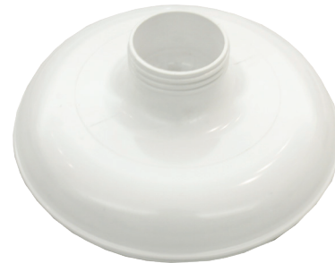
Jelly Jar Back of Fixture Shown