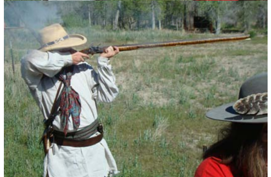
Rabbit showing how it all works.