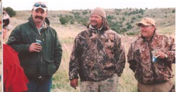
A few pictures of the folks that enjoyed the frolic -