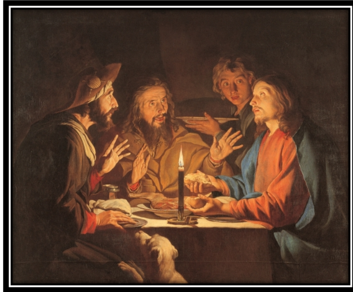
Image: Matthias Stom, Supper at Emmaus, 17th century

Three of the four Gospels give us accounts of more than half a dozen appearances of Jesus after his resurrection. All the Gospels except for Luke tell about Jesus appearing to the women on Easter morning. Luke, on the other hand, tells about Jesus' appearance with two disciples on the road to Emmaus. John describes two appearances, one to the disciples when Thomas was absent, and another when Thomas was present. Mark tells about Jesus appearing to the Eleven as they sat at table, and John describes the appearance of Jesus to the disciples at the Sea of Galilee. Jesus' final appearance includes the commissioning of the disciples in Matthew and the ascension in Mark and Luke. Through these accounts, which we hear proclaimed in the Gospels and the readings from the Acts of the Apostles throughout the Season of Easter, we enter into the experience of the early Church as they recognize that Jesus is truly risen, He "has been raised" but "is not here."