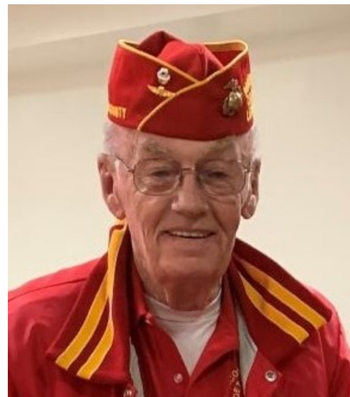
Stop the presses somebody caught Blu smiling!