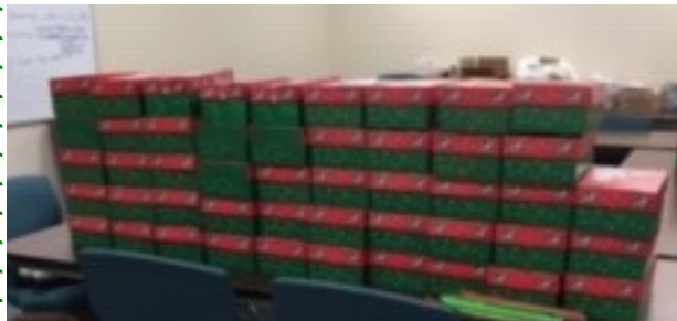
Our 48 boxes delivered to the Calvary Baptist Church in Elko.

donation will be added to ministry partners in over 100 countries. With your help, we are blessed to have the opportunity to participate in this discipleship program.