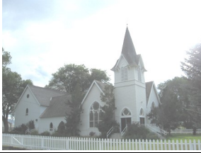
Lamoille Community Presbyterian Church