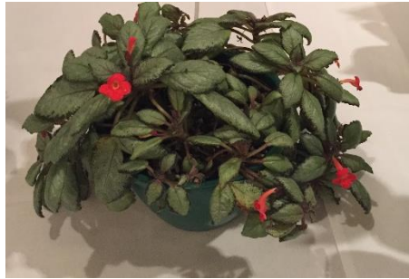
Episcia Toy Silver