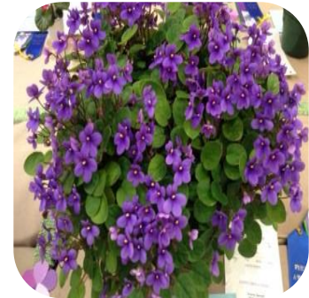
Pixie Blue Trailer

A POTPOURRI – HELPFUL TIPS I’VE LEARNED ABOUT GROWING AFRICAN VIOLETS Roxanne Carney