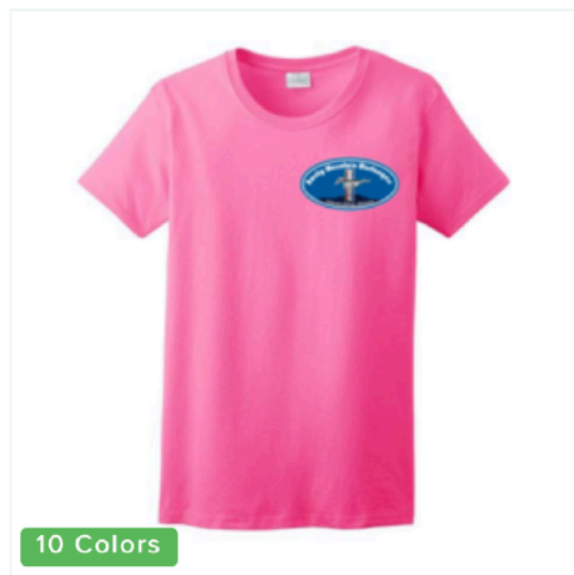
Gildan® - Ladies Ultra Cotton® 100% Cotton T-Shirt $12.00