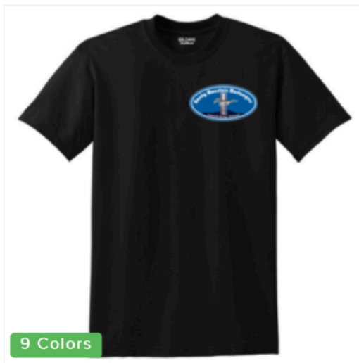
Gildan - DryBlend 50 Cotton/50 Poly T-Shirt $12.00