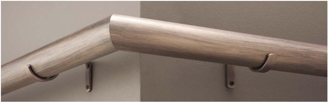
Shown: 90° outside corner miter for 225WS wood pole, WL1 steel brackets, finish 710 Tarnished Sliver