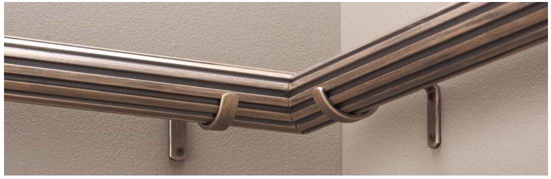
Shown: 90° inside corner miter for 225WG wood pole, WL1 steel brakets, finish 710 Tarnished Silver

• We can miter our wood poles at any angle for you.