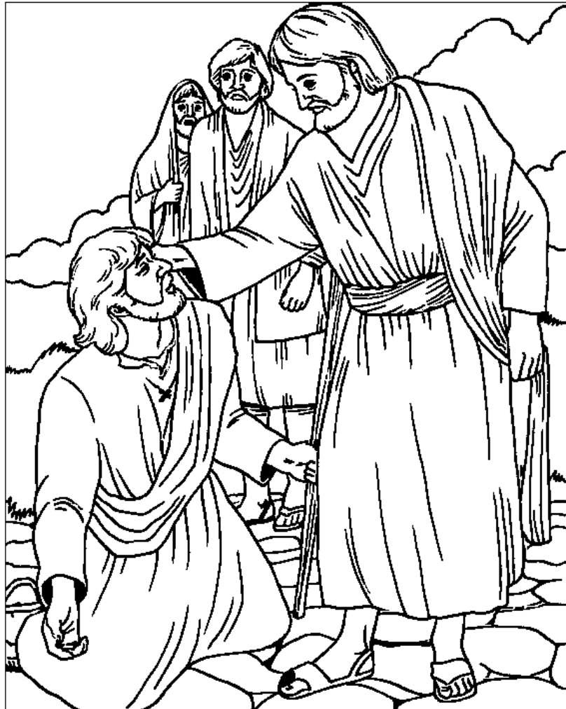
Jesus Heals a Blind Man Mark 10:46-51

From BibleStoryCard Learning System™ Coloring Book © 1996 Wesleyan Publishing House http://www.parable.com/wph/group_1052.htm