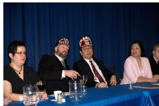
2018 Past President's Dinner New format for an old event