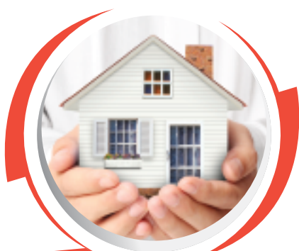
Housing & Shelter

Expected End Ministries requires monetary and material contributions and donations for the following 9 areas of immediate need.