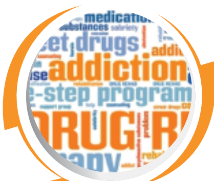
Substance Abuse Programs