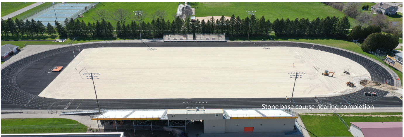
Stone base course nearing completion