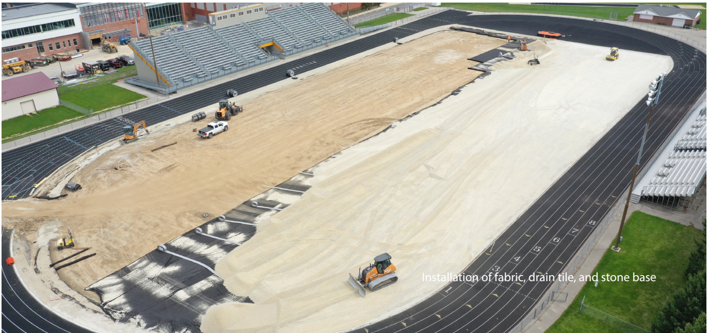
Installation of fabric, drain tile, and stone base