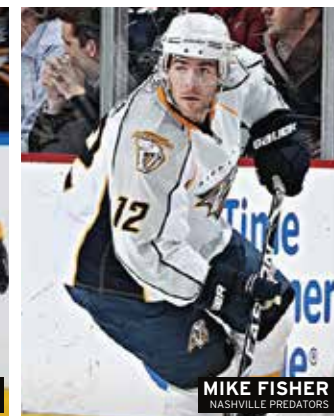
MIKE FISHER NASHVILLE PREDATORS