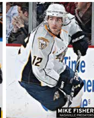
MIKE FISHER NASHVILLE PREDATORS