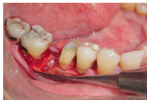
Figure.8: DFDBA graft placed in the socket