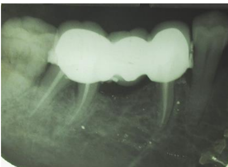
Figure.14:IOPA of Fixed prosthesis in 46,47