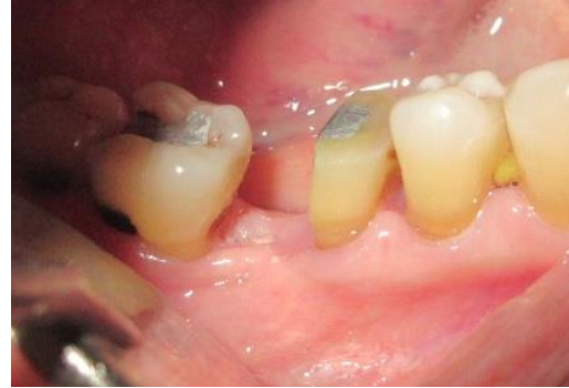
Figure.11: 1 month follow up