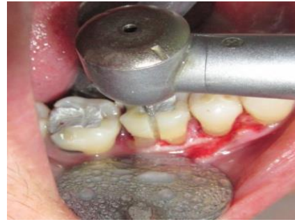
Figure.5: Sectioning of 46 with air rotor