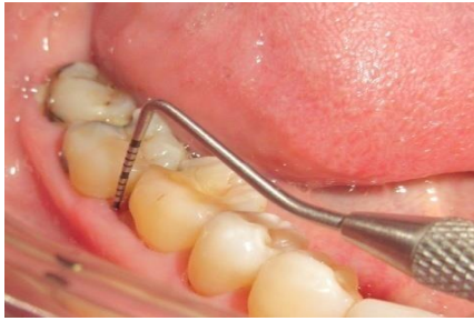
Figure.1: Carious 46, 47 with probing depth of 5mm