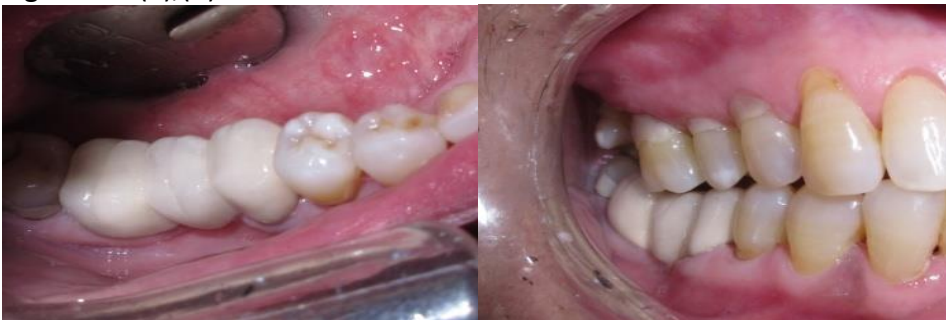
Figure. 13 (a),(b)