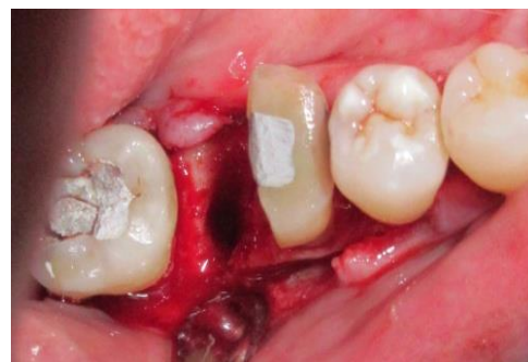
Figure.7: Removal of distal half of tooth