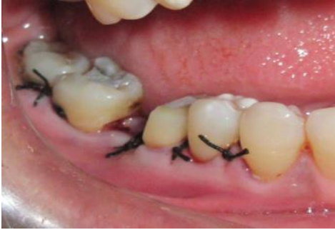
Figure.9: Sutures placed