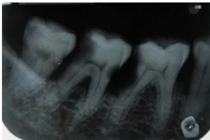
Figure.2: IOPA showing caries in distal root of 46 and coronal 47. Horizontal bone loss present in 46, 47.