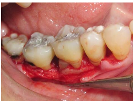
Figure.4: Open flap debridement from 44-48