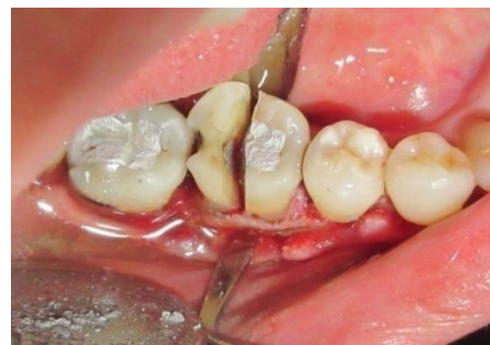
Figure.6: Sectioning of 46 completed