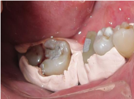
Figure.10: Periodontal pack