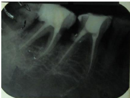
Figure.3: Post RCT IOPA of 46, 47.