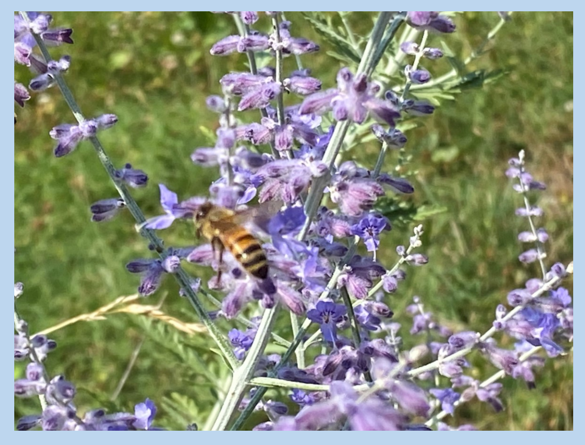
Russian Sage-July 9, Overland Park, KS.