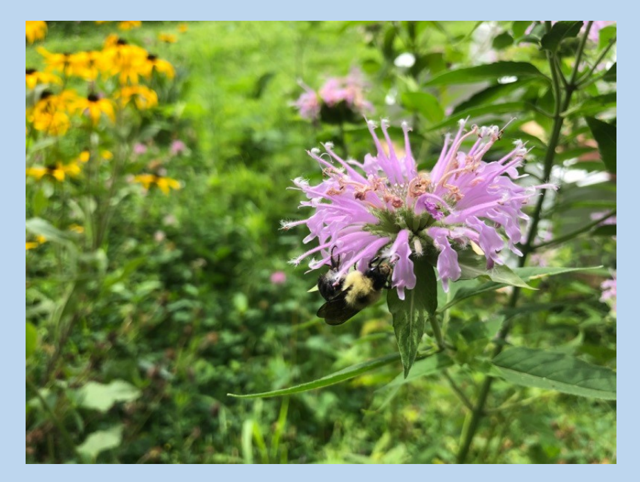
Monarda (Bee Balm)-July 21, Berryton, KS