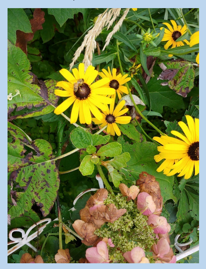
Black-eyed Susan – July 27, Olathe, KS