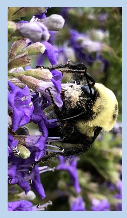
Vitex-July 23, Berryton, KS