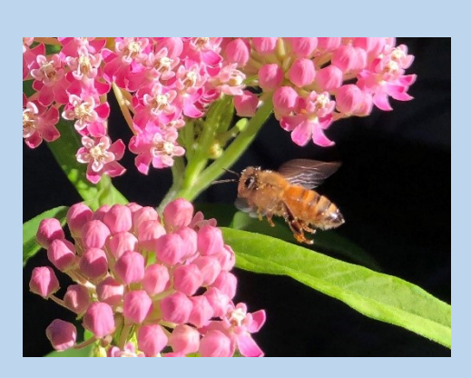
Swamp Milkweed-July 12, Berryton, KS