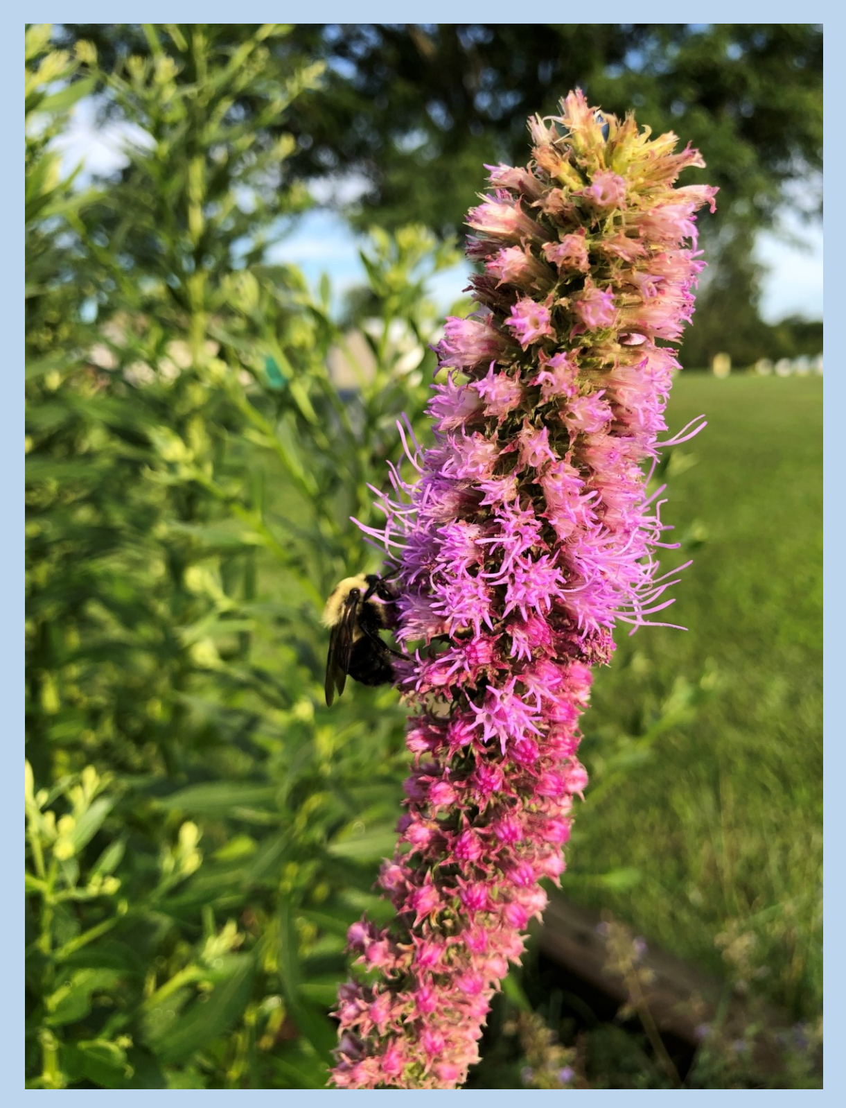
Blazing Star (Liatris spicata)-July 27, Berryton, KS