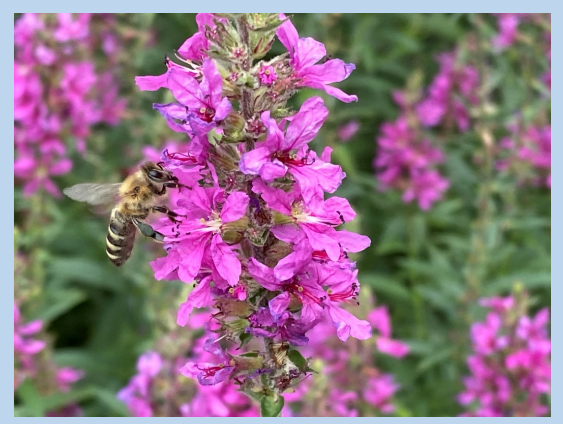
Butterfly bush-July 9, Kansas City, Kansas - R. Burns