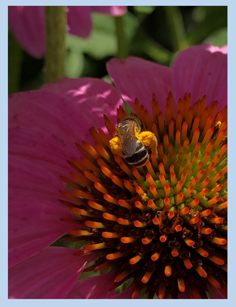
Coneflower (Echinacea) – July 12, Berryton, KS