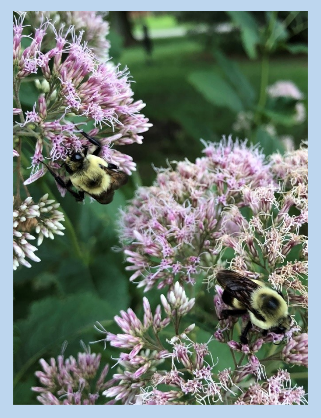
Joe Pye Weed-July 17, Berryton, KS