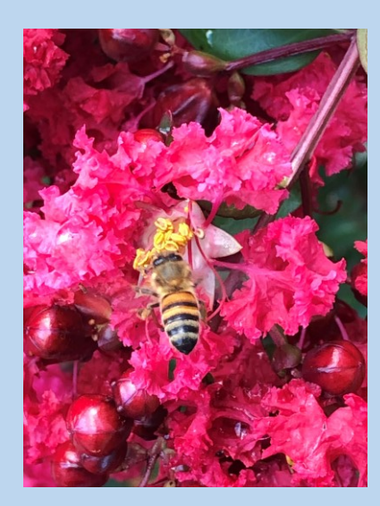
Crepe Myrtle – July 21, Auburn, KS