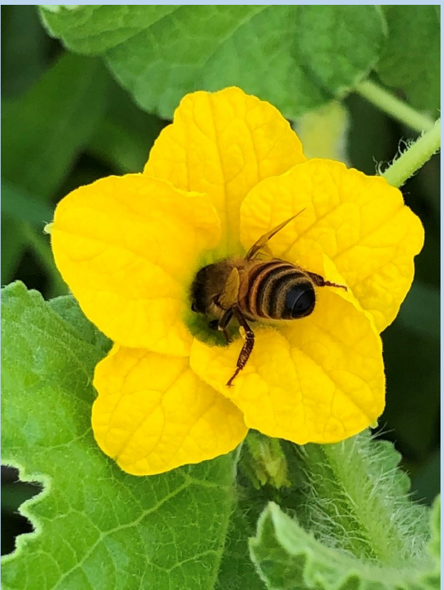
Melon-July 19, Berryton, KS