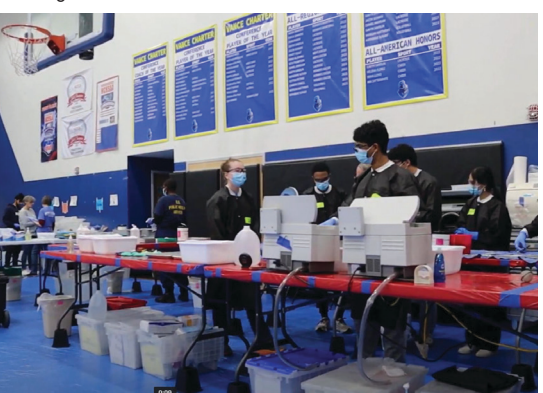
The Remote Area Medical Clinic (RAM) will once again provide no cost medical, dental, and vision care services during a two-day clinic to be held at Vance Charter School.

Turning Point Community Development Corporation – Creating Success Education Center-School Age Programs, increases access to resources, opportunities, and experiences for school-age youth through out-of-school time (OST) programs by offering affordable, quality child care that meets the educational, health, and social needs of children and youth in an after-school and summer learning program setting. A second program, Launchpad Youth Workforce Development, provides youth workforce development for unserved youth in grades 9 - 12. The cohort begins in the summer with students completing a series of engaging training workshops. Students are placed in paid internships with local community organizations. Students participate in experiences throughout the academic year, including a college tour, two mental health seminars, and a two-day public speaking camp. Finally, Oasis Food Pantry & Distribution Center, works in partnership with the NC Food Bank and Golden Leaf Foundation to provide a "market" style pantry where individuals can select desired items from the shelves, refrigerator, freezer, or from merchandisers. Services also include distribution events including produce boxes. The center will host a monthly nutrition class or cooking demonstration that will be advertised to families who utilize the pantry.