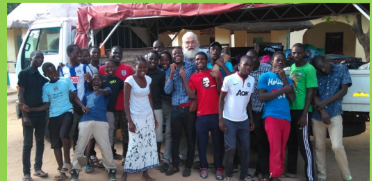
Goofin around heading out to school !!!!!