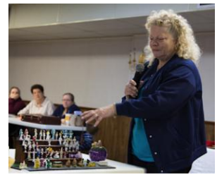
Alice Lowe's Haydel ceramic miniature collection.