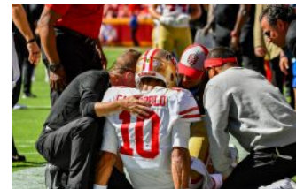
The Niners Lose Jimmy Garoppolo and Their Season to Torn ACL