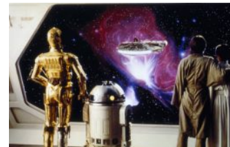
'Star Wars' Producer Gary Kurtz Dead at 78