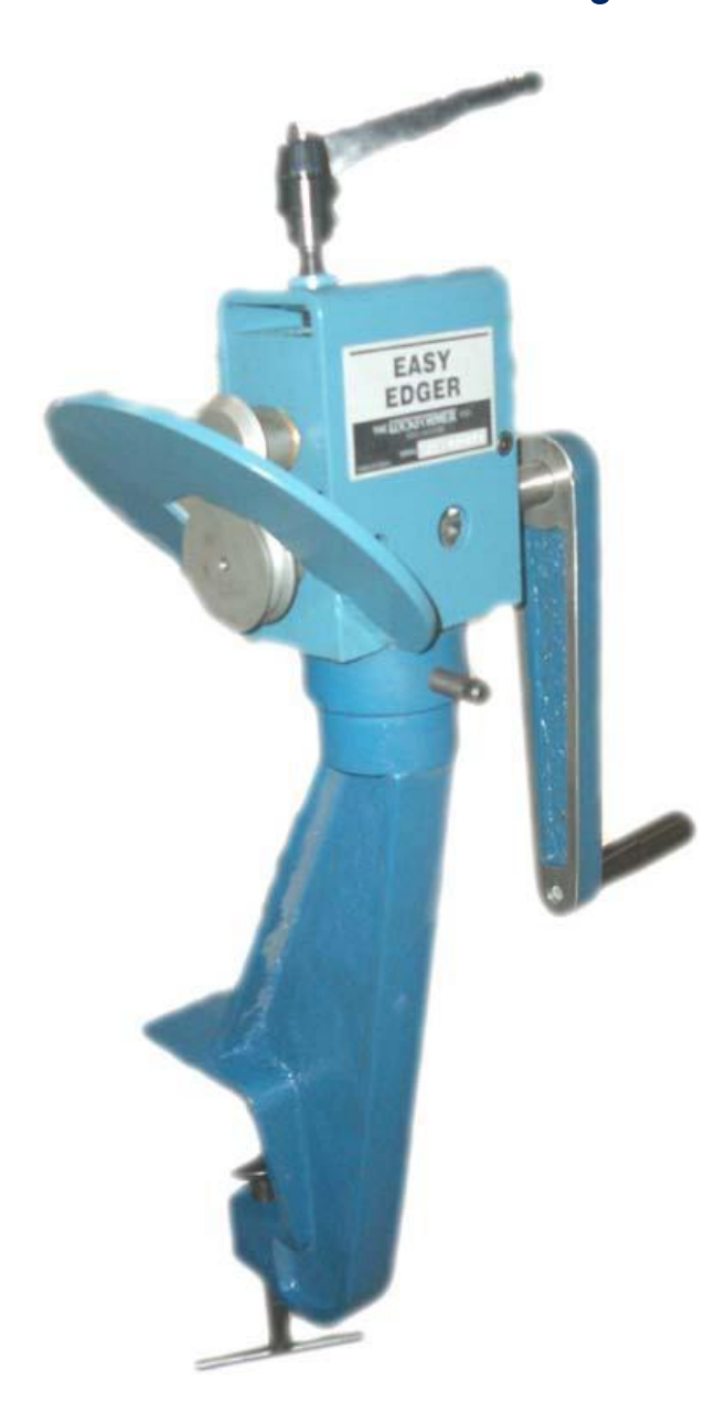
Easy Edger Instructions and Parts Diagram