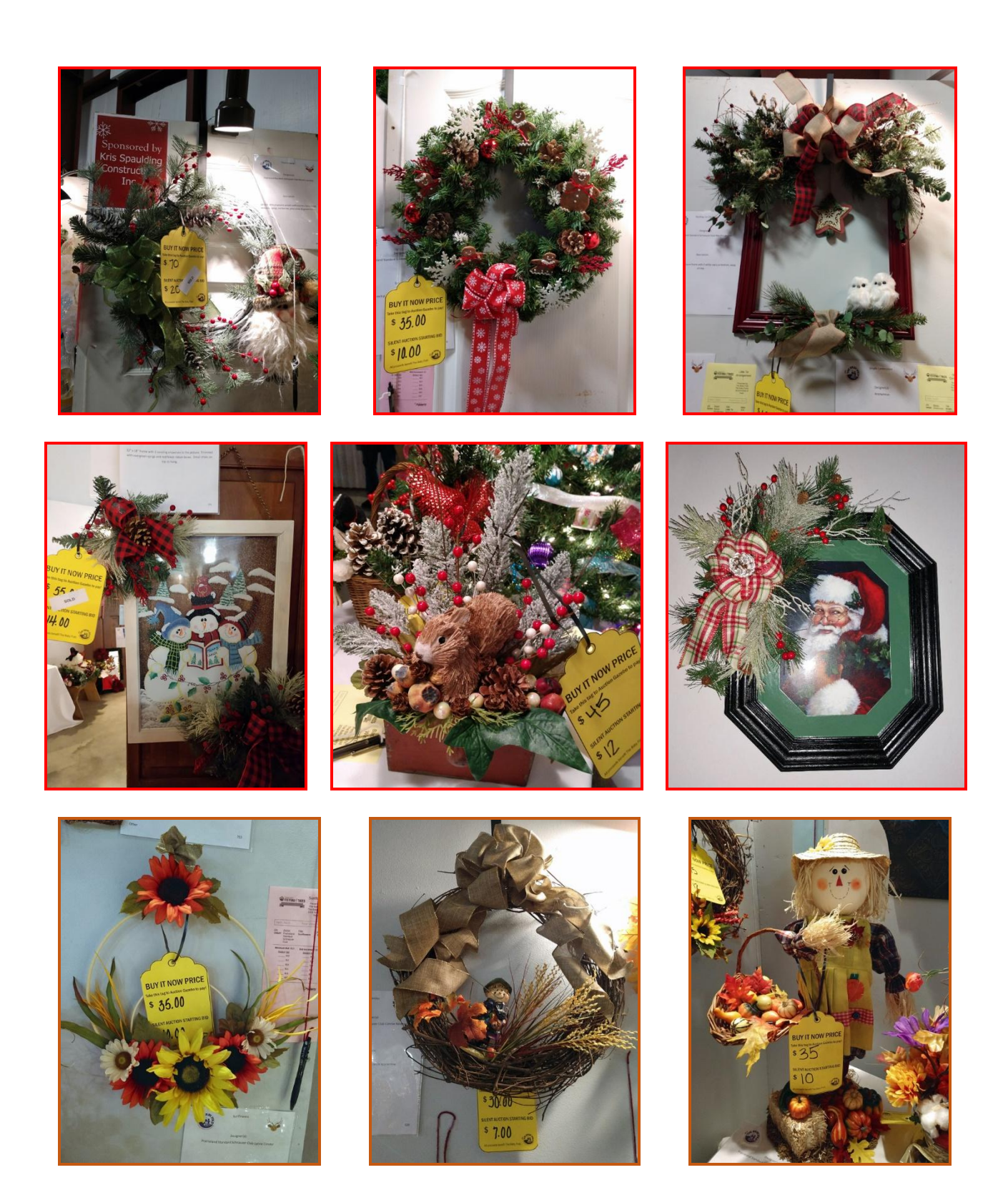
Editor's Note: I am always blown away with the talents of the PSSC members. Great job everyone!