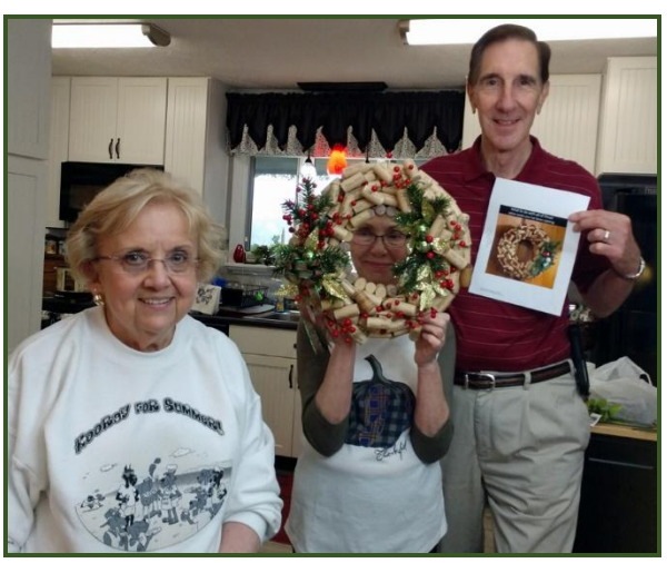
All it takes is a good picture and some patience