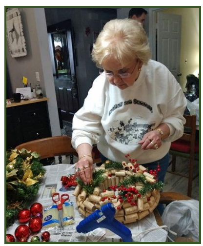
Lots of good wine went into this wreath