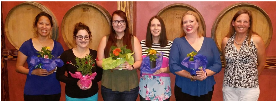
2018-2019 Executive Board (minus our Secretary)

Positions highlighted in yellow denote open positions