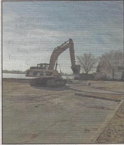
The site of the former Henry's Restaurant, November 2010

The famed building that once was Henry's Restaurant in Algonac was torn down after 73 years this past November to make room for a parking lot and mooring location for the Russell Island Ferry. Let's take a look back in time.