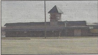
The boarded up Henry's Restaurant in early 2010