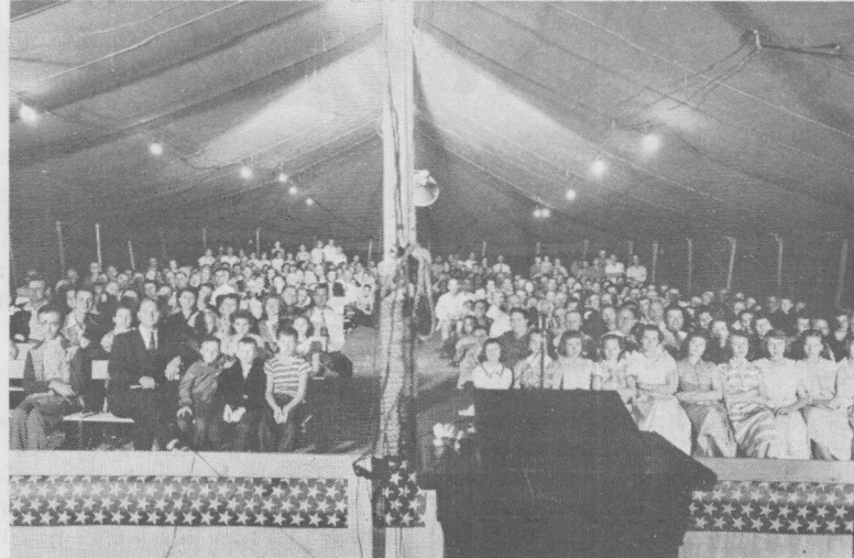
BAXTER SPRINGS CAMP MEETING

The housing condition was crowded but the students didn't mind. There were dormitory tents of various sizes for boys