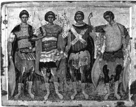
Ss Demetrius, George, Procopius and Artemy (Hilandar Monastery, Athos, 17th Century)