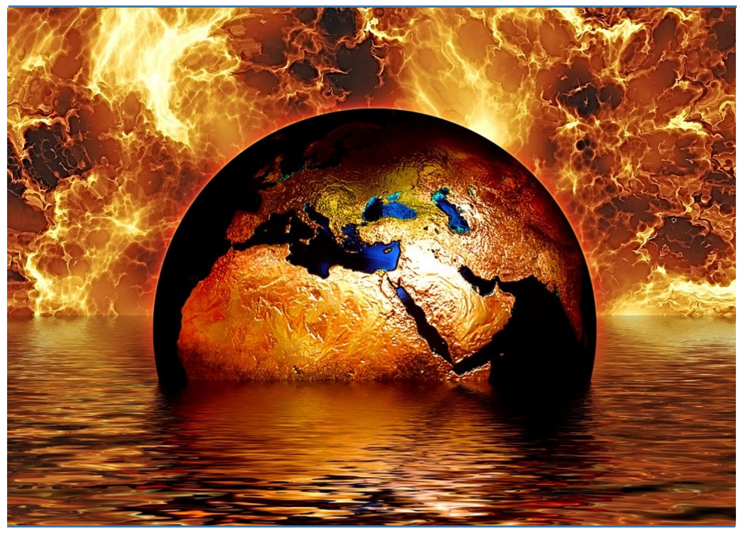
May You Find Christ Here...May You Bring Christ to the World!