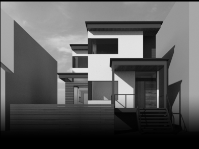
6074 N HERMITAGE