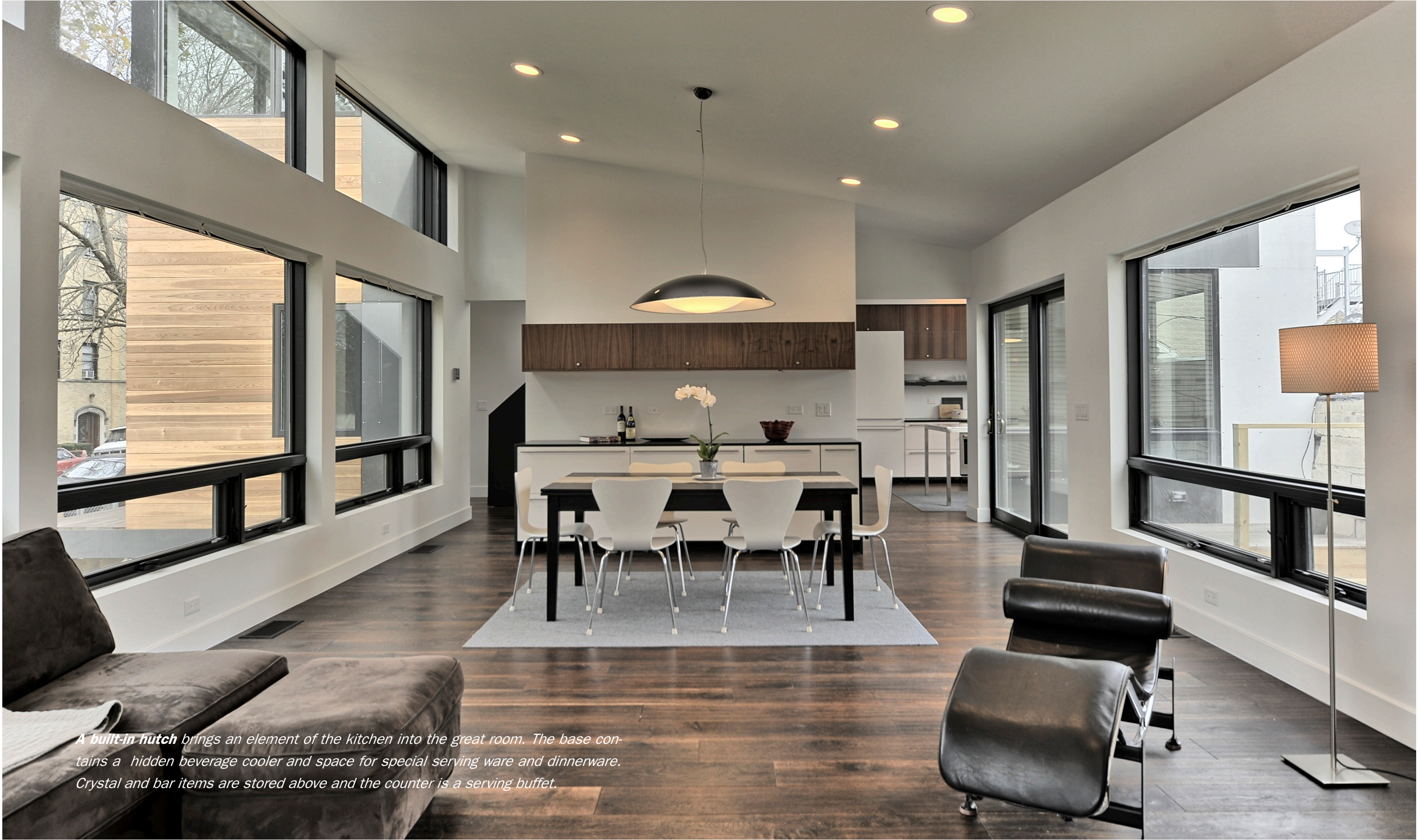
A built-in hutch brings an element of the kitchen into the great room. The base contains a hidden beverage cooler and space for special serving ware and dinnerware. Crystal and bar items are stored above and the counter is a serving buffet.