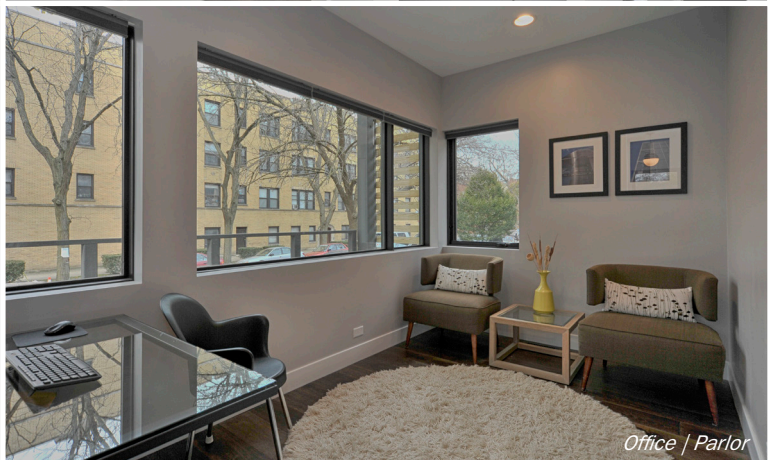
Office / Parlor