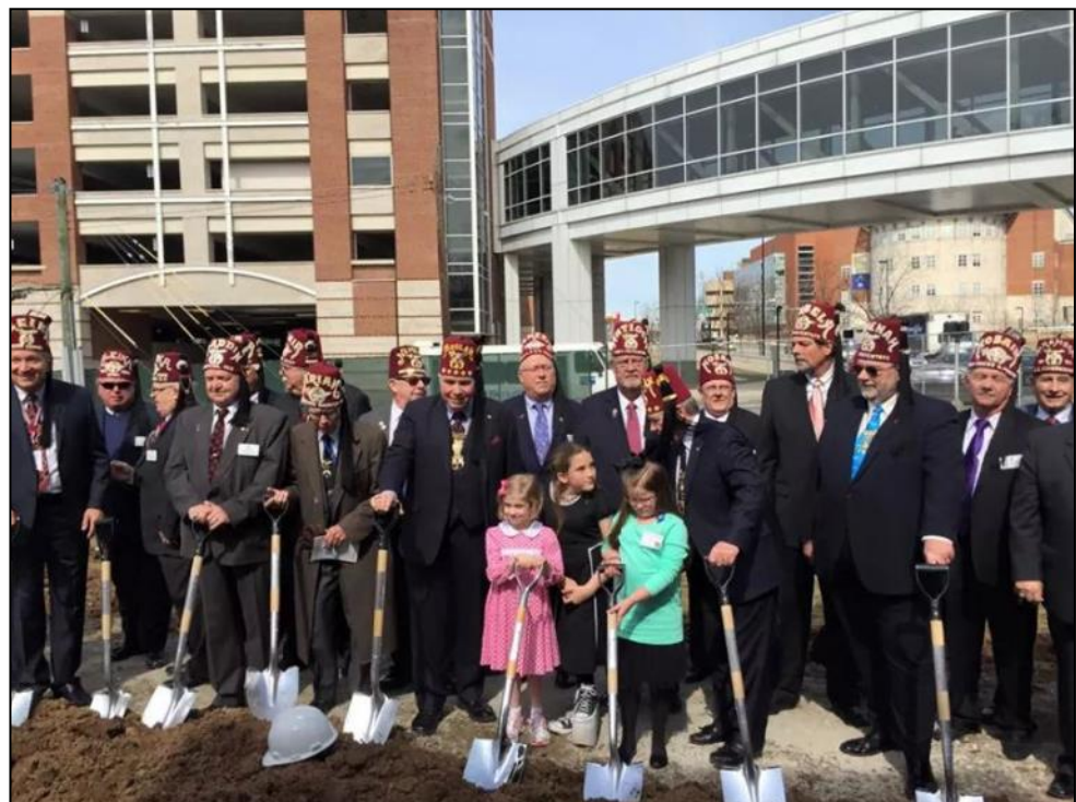
Ground Breaking Ceremony for new Lexington Shriners Hospital for Children Medical Center