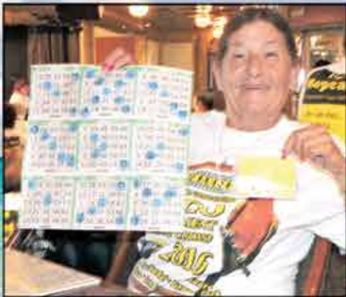
SAILING FROM ORLANDO, FL.