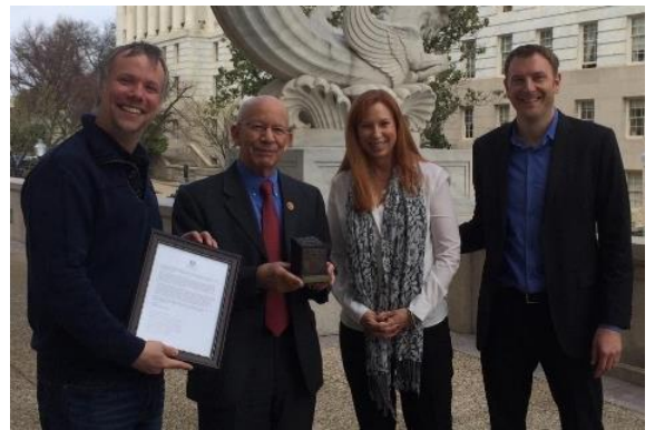
Representative Peter DeFazio receives award from Oregon Workforce Partnership leaders

This Workforce Champion Award was designed and manufactured in Oregon, where innovative 21st century skills were used to craft this award. Cannonball Media, a company based on Bend that specializes in high-quality 3D motion graphics, designed the award using stereo lithography 3-dimensional modeling. Jeld Wen, one of the world's leading manufacturers of reliable windows and doors, converted the 3D model to a solid form, then utilized a 3D printer they designed to print the award. It's made from bronze/brass powder and polylactic acid. The key messages embodied in this award: design skills matter, creativity matters, manufacturing and technology skills matter, organizing and project management skills matter and Investment in Workforce Development Matters!