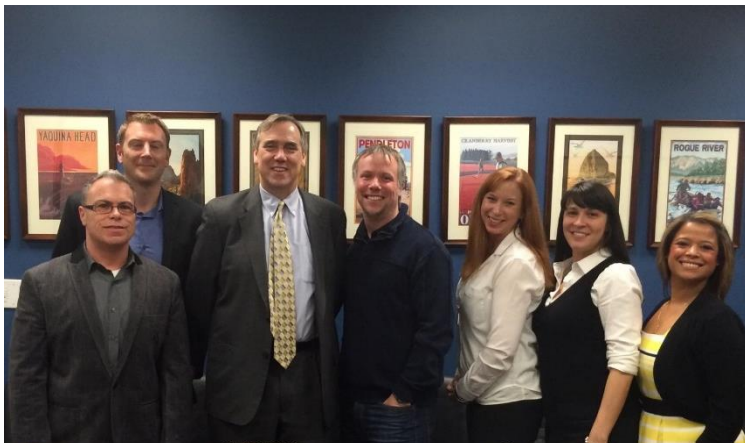
Senator Jeff Merkley meets with Oregon Workforce Partnership leaders