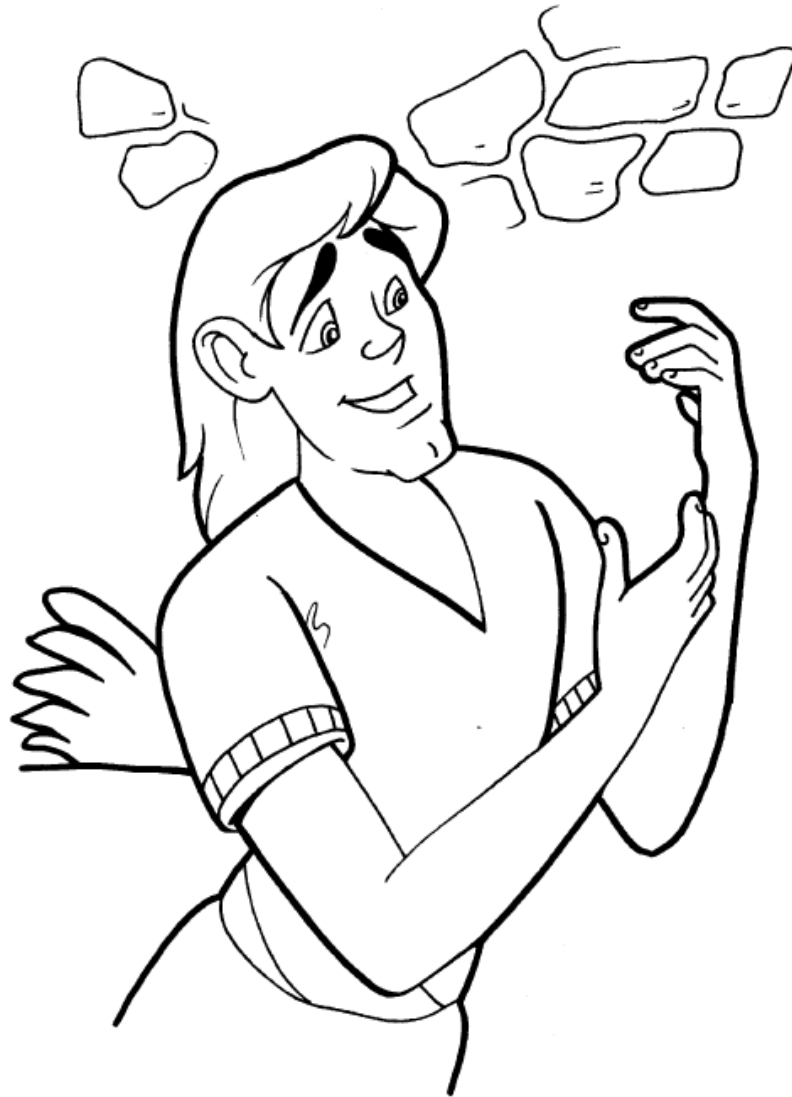
Jesus Heals a Withered Hand Mark 3:1-6