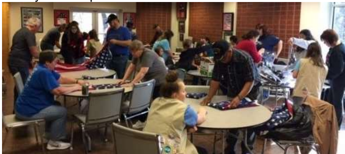
Folding flags with fellow veterans and Girl Scouts.

December was unusually busy beginning on Saturday the first when we again partnered with the TCVC and Girl Scout Troop 13804 to properly fold more than 400 American flags which had been flown as part of the Carl Perkins Center for the Prevention of Child Abuse annual fundraiser. We enjoyed a pizza lunch and the excitement and enthusiasm of the Girl Scouts as they learned proper flag folding techniques and shared with us their knowledge of flag history and etiquette.