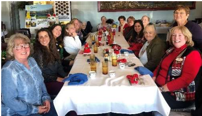
Almost 100% attendance at our year-end meeting!

We have located two women veterans who are residents of nursing homes. We have provided them with tabletop Christmas Trees and lap quilts, courtesy of the Santa Rosa Quilt Guild and plan to continue visiting them.