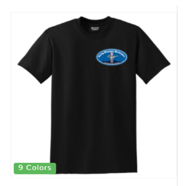
Gildan - DryBlend 50 Cotton/50 Poly T-Shirt $12.00