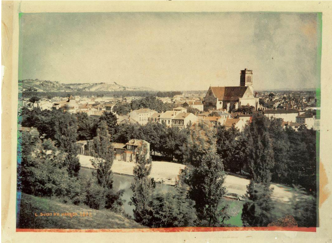
"View of Agen" 1877

"It was considered the best photo of this century. A lioness and her cub were crossing the savannah but the heat was excessive and the cub was in great difficulty walking. An elephant realized that the cub would die and carried him in his trunk to a pool of water walking beside his mother.